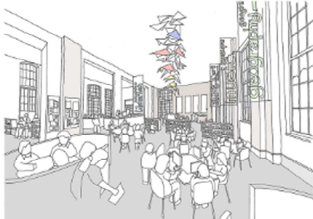
OPENING UP THE HALL WITH THE REMOVAL OF INTERNAL WALLS MULTI PURPOSE HALL WITH CHARACTER FEATURES