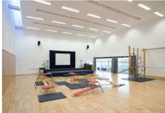
ENLARGE EXISTING HALL PROVISION TO CREATE A LARGE HALL